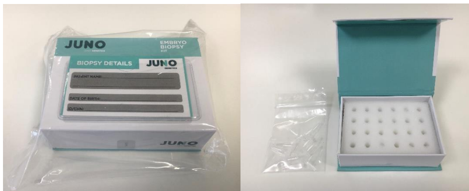
The Juno Biopsy Kit and it's components

Juno biopsy box in a sealed bag: The plastic rack should be stored sealed in the bag provided at room temperature in a contaminant free area.